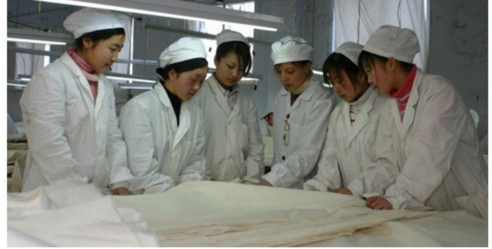
Mending : 40 experienced mending workers ensure the quality of fabric and delivery time.